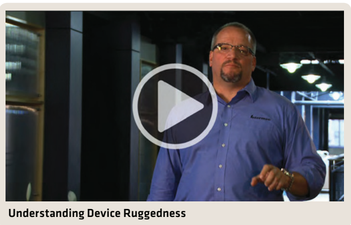
Understanding Device Ruggedness

Because downtime is so expensive, there is clear value to keeping these devices functional. Ruggedness is a requirement, not an option, when working extensively outside office and home environments. In the real world, mobile phones will be dropped onto concrete, and they will be rained on. That doesn't mean the phone will stop working. There are product features that protect phones – and preserve productivity – in very challenging environments. The following sections explain how specific features and product characteristics impact reliability in non-office environments.