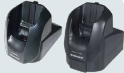
Cradles (USB, RS232/USB, RS232, Ethernet)