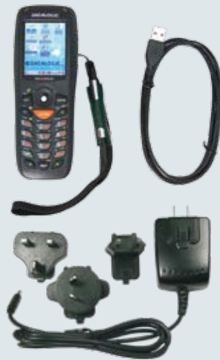
Inside the box